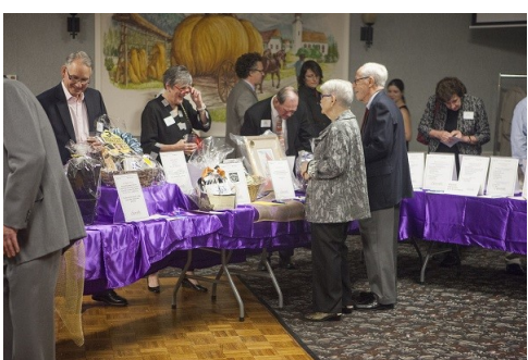
Attendees look over the silent auction items